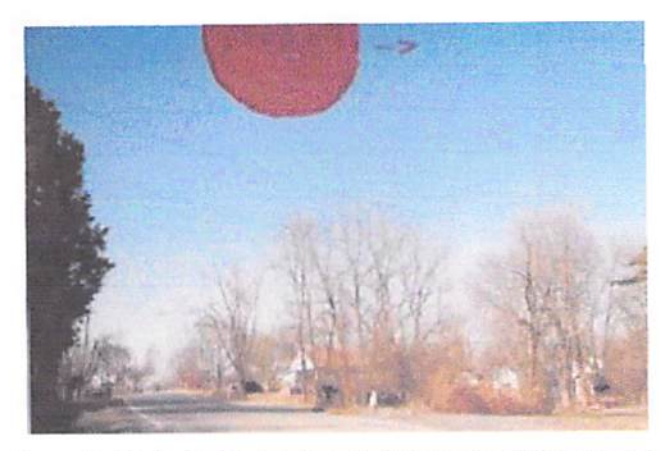
Above: Suddenly the big bright red ball that looks like the moon but is as large as a house appears above the road where they are standing and begins to move off to the right and hover over a field to the right.