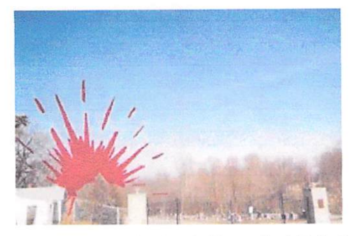
Above: The object proceeds to lower itself into a valley that is directly behind the white house.