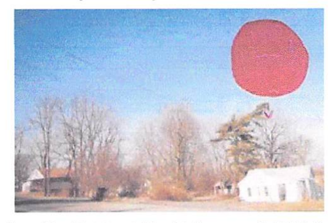
Above: The object stops at this point. Hovers over the field behind the white house. (continued on page 3)